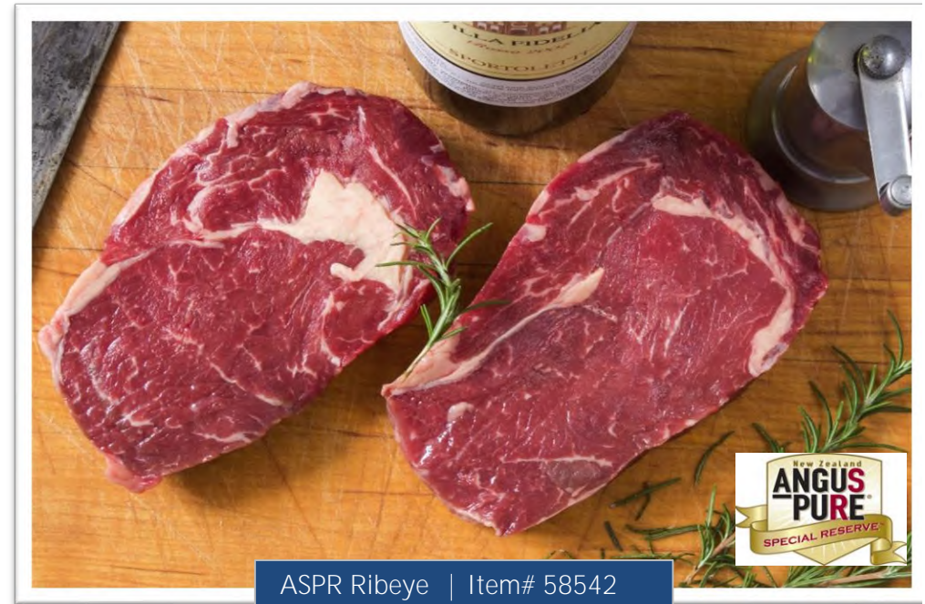
ASPR Ribeye | Item# 58542

ANGUSPURE NEW ZEALAND PASTURE RAISED GRASS FED, GRASS FINISHED BEEF. THE FINEST ANGUS GENETICS RAISED ON THE PUREST GRASSLANDS IN THE WORLD. BEEF...THE WAY NATURE INTENDED