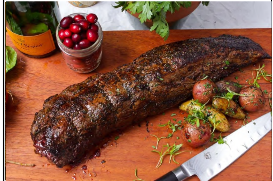
Bison Tenderloin 189A | Item 24269

Experience an American Classic, straight from the ol' Frontier