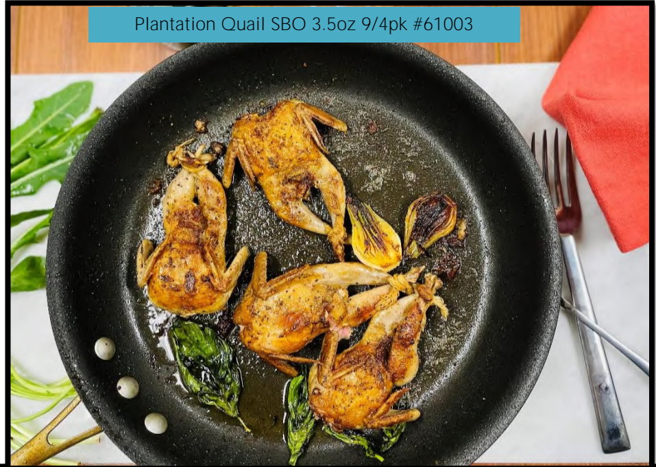
Plantation Quail SBO 3.5oz 9/4pk #61003