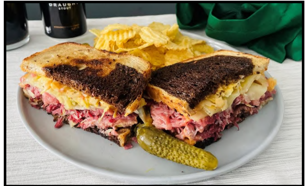
All year Round! Wagyu Corned Brisket 6pc cs/30#avg cs Item# 57350