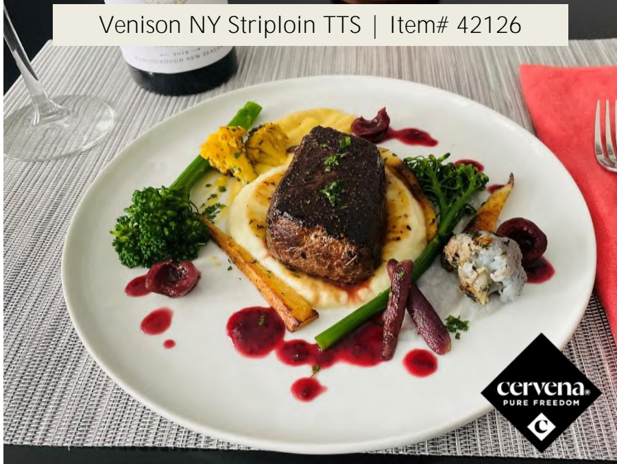
Venison NY Striploin TTS | Item# 42126