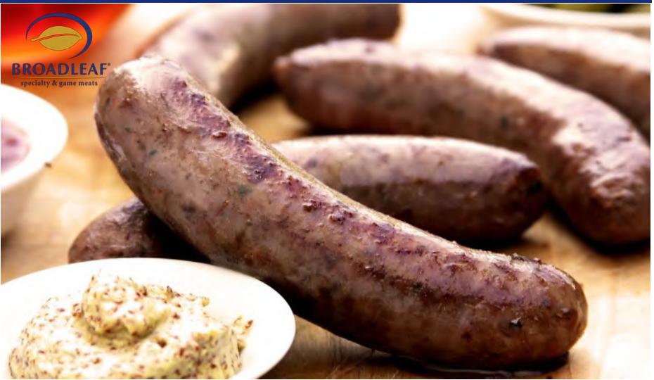
Wild Boar Bratwurst 5-1 | Item# 71002