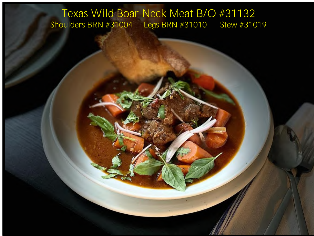
Texas Wild Boar Neck Meat B/O #31132 Shoulders BRN #31004 Legs BRN #31010 Stew #31019