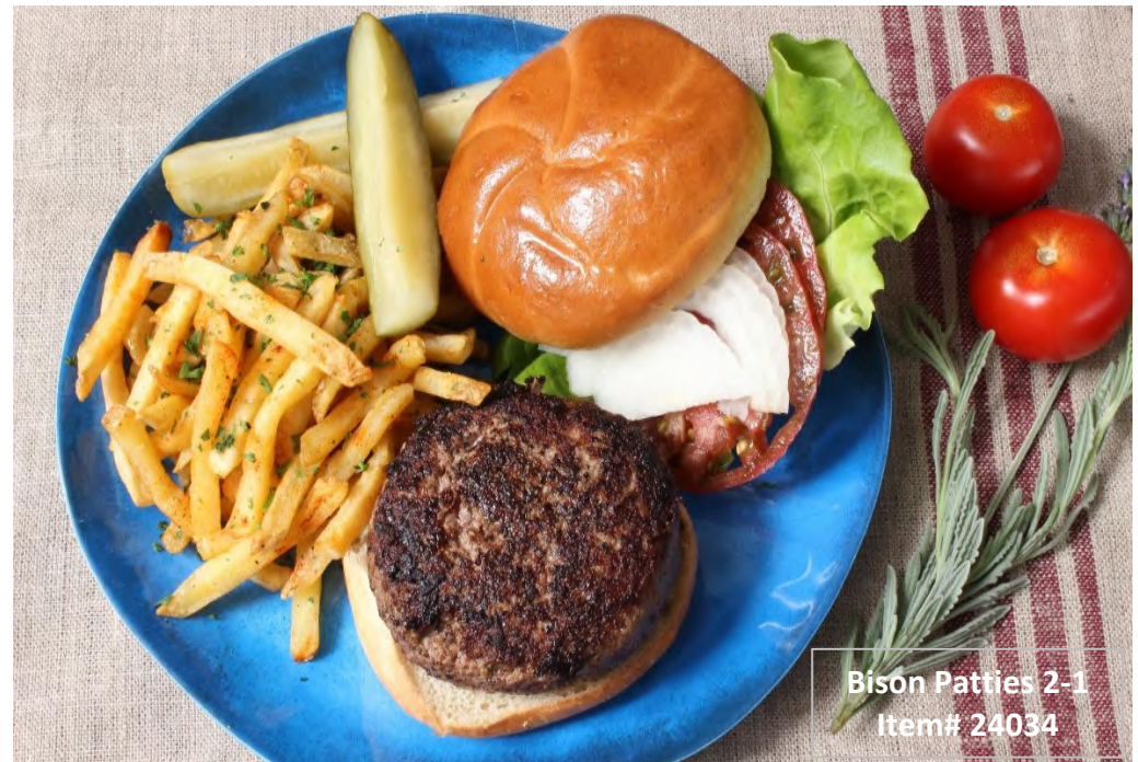
Bison Patties 2-1 Item# 24034