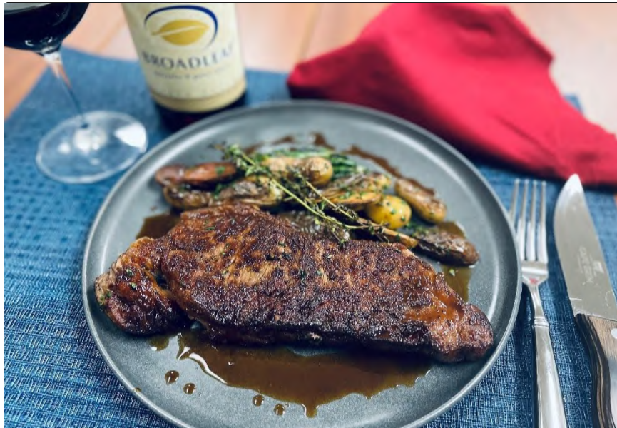
North American Bison Strip Steak | Available in 8oz, 10oz, 12oz & Retail