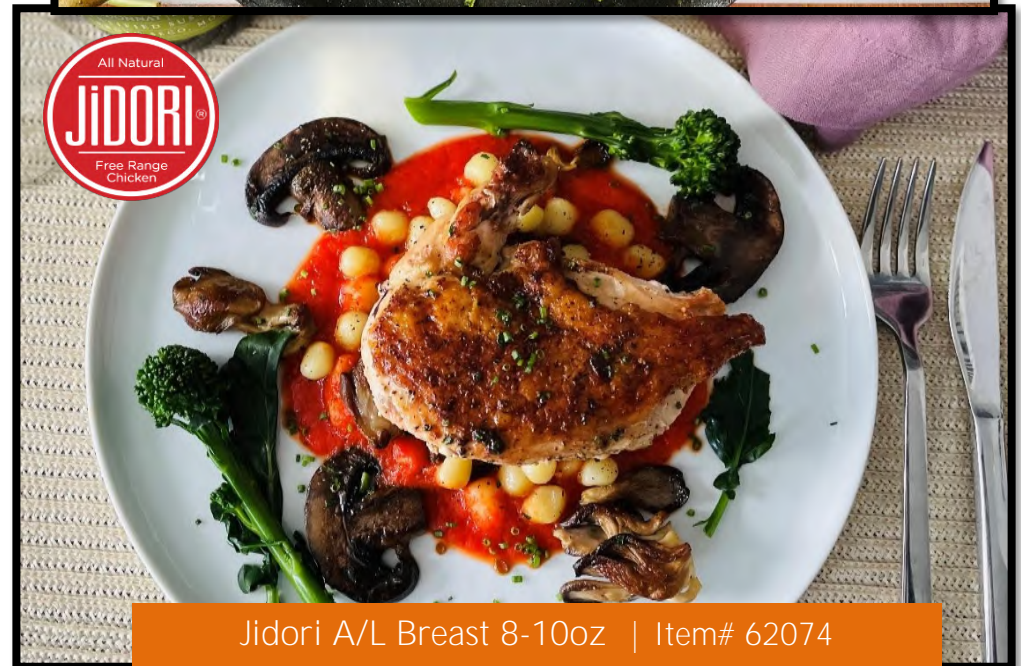
Jidori A/L Breast 8-10oz | Item# 62074