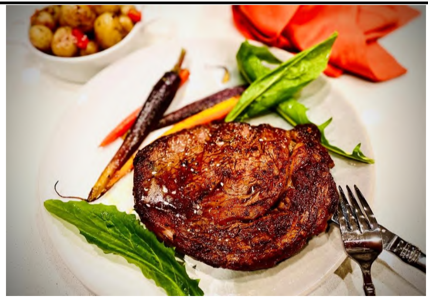
North American Bison Ribeyes 12oz item #24050